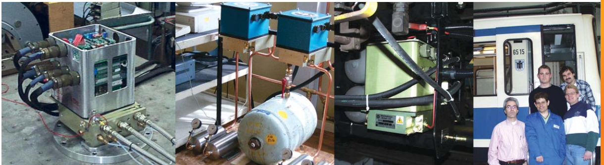
EP 2002 passes the HALT test